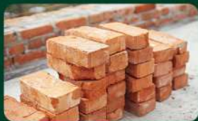
RED BRICK CONSTRUCTION