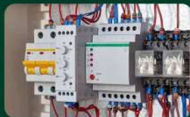
3 PHASE EB CONNECTION