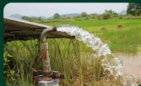
BORE WATER & WATER TANK