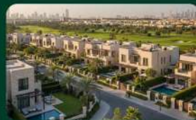
READY TO MOVE VILLA