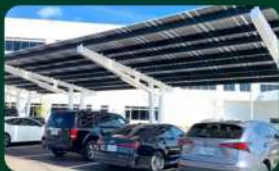
COVERED CAR PARKING