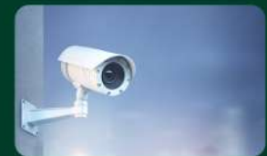
24 HRS SECURITY & CCTV