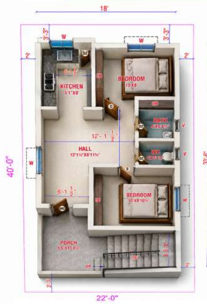
2BHK SOUTH FACING ENTERNCE