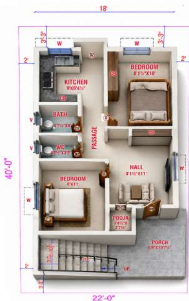
2BHK NORTH FACING ENTERNCE