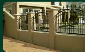
COMPOUND WALL WITH GATE